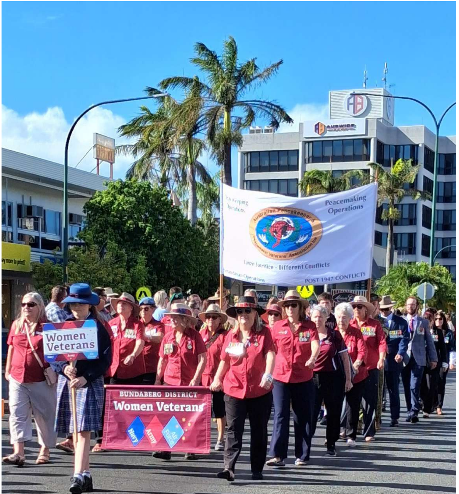
BUNDABERG CITY ANZAC PARADE 2026 – WOMEN VETERANS