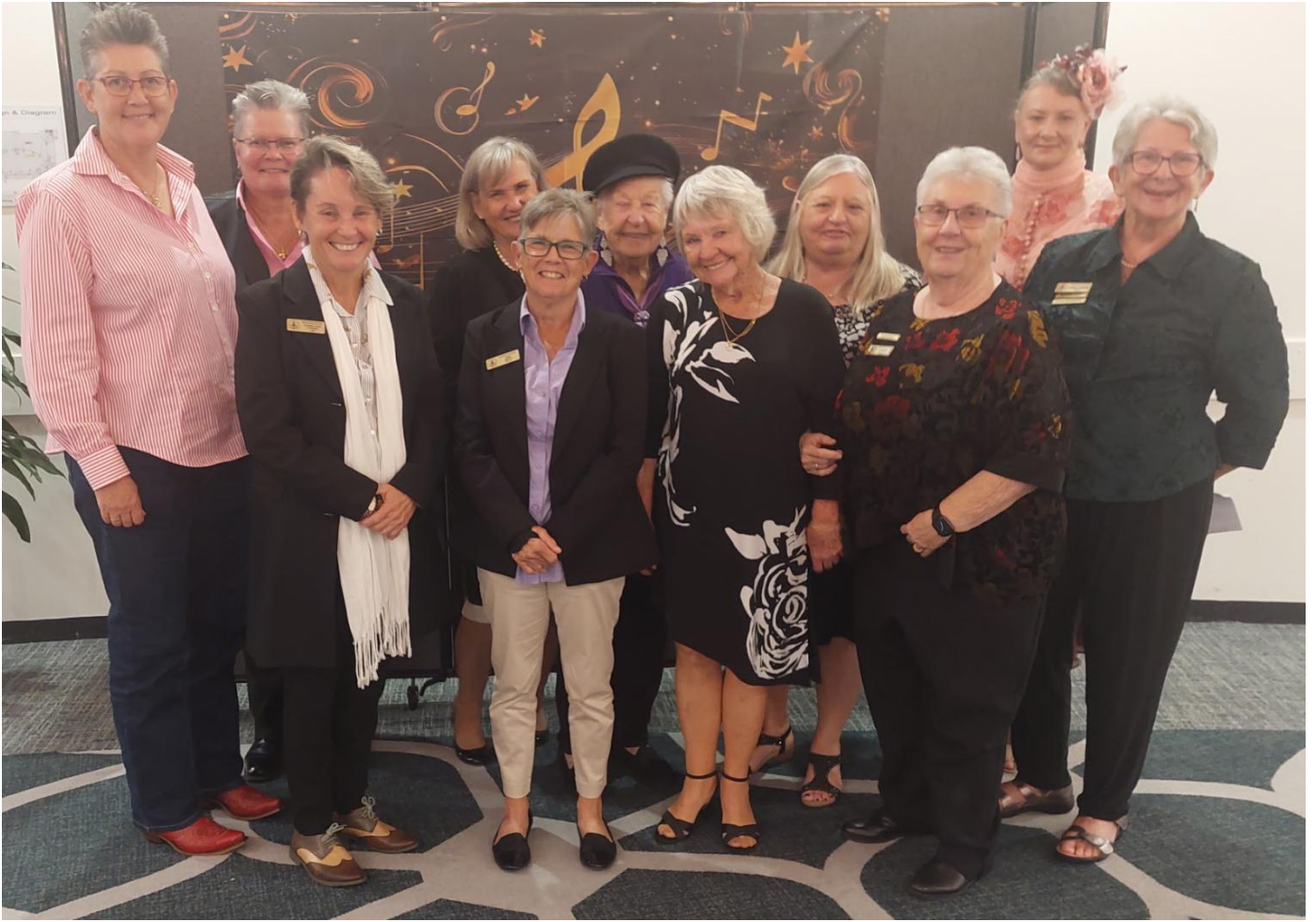
Cuppa time on the Terrace at the RSL (3 rd Friday, 1000 Hrs)