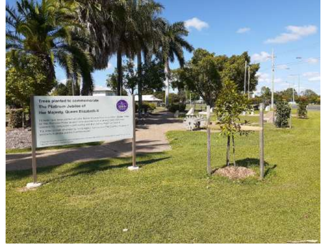
Lion's Remembrance Park New tree plantings are those with protective stakes