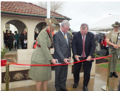
Left: Australian Service Nurses Memorial Wall unveiled