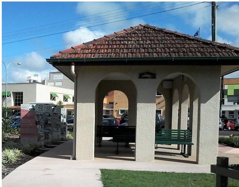
Above: Storyboards in the Peace Garden are adjacent to the 1949 War Nurses Pavilion and are accessed by the newly installed pathway officially named Anzac Centenary Memorial Avenue. The War Nurses Memorial wrought iron signage from the original park gate has been attached as a link to the park's past