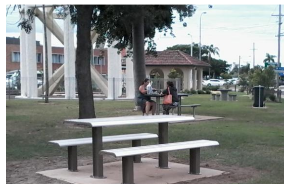
Below: Three new picnic table settings were also funded from our enhancement project