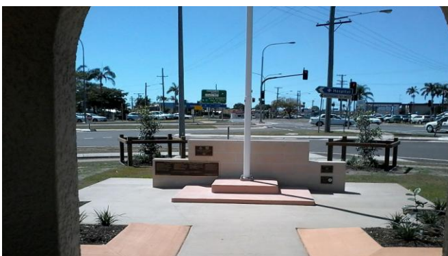
Above: Some of the many new plaques and signs installed as part of the enhancement project.