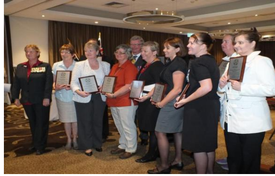
Above: Commemorative plaques were presented to the regional health centres by the Governor of Queensland