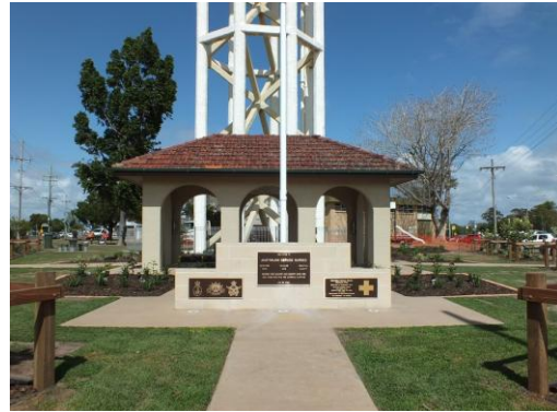
Above: Stage 1 completed just in time for dedication service on 24 th September 2014