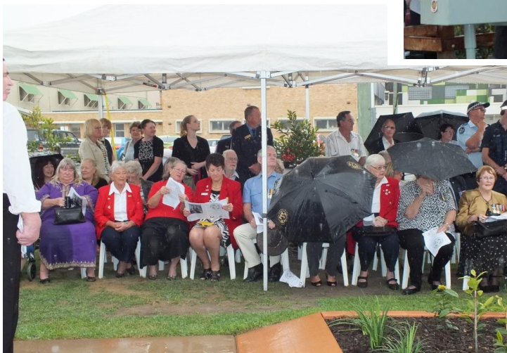
Left: Some of the crowd seeking shelter from the rain after 6 weeks of drought