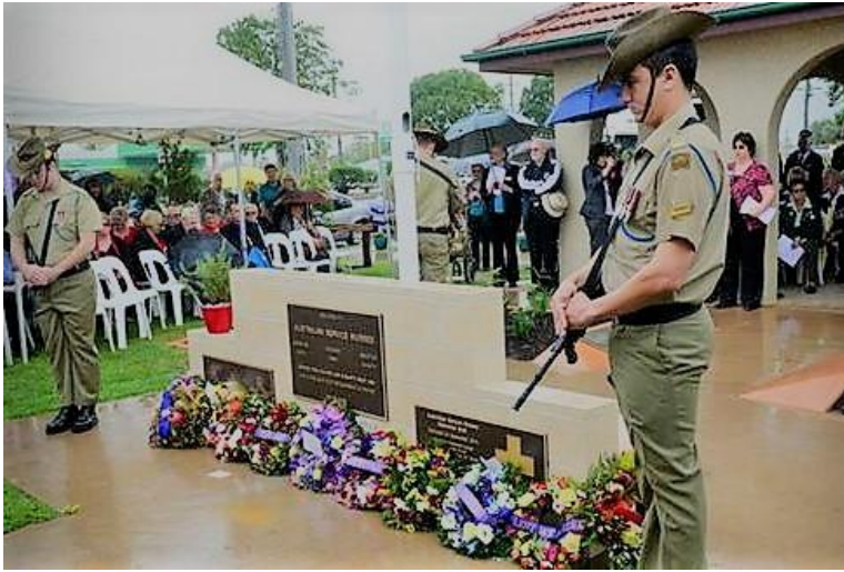
Above Left: Catafalque Party supplied by D Coy 9 RQR