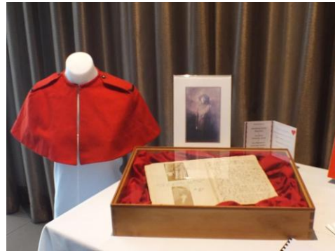
Historical display on Australian Nurses was featured at morning tea and the Centenary of Anzac Luncheon.