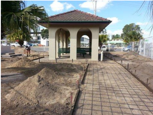
Above: July 2014 . Enhancement project commences