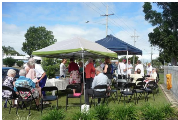
Below: Association members boiled billies on camp stoves and provided a picnic morning tea following the official opening of the storyboards