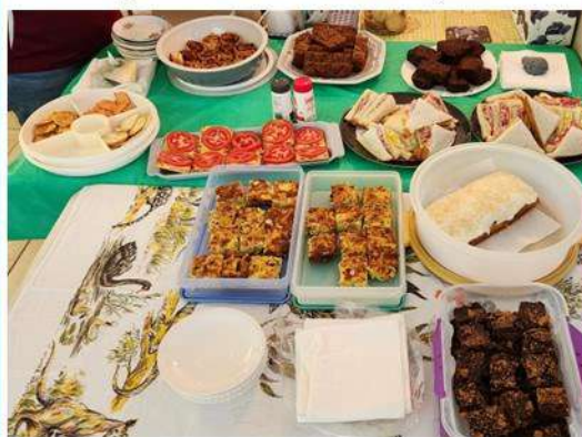
MC CATERING TREATS